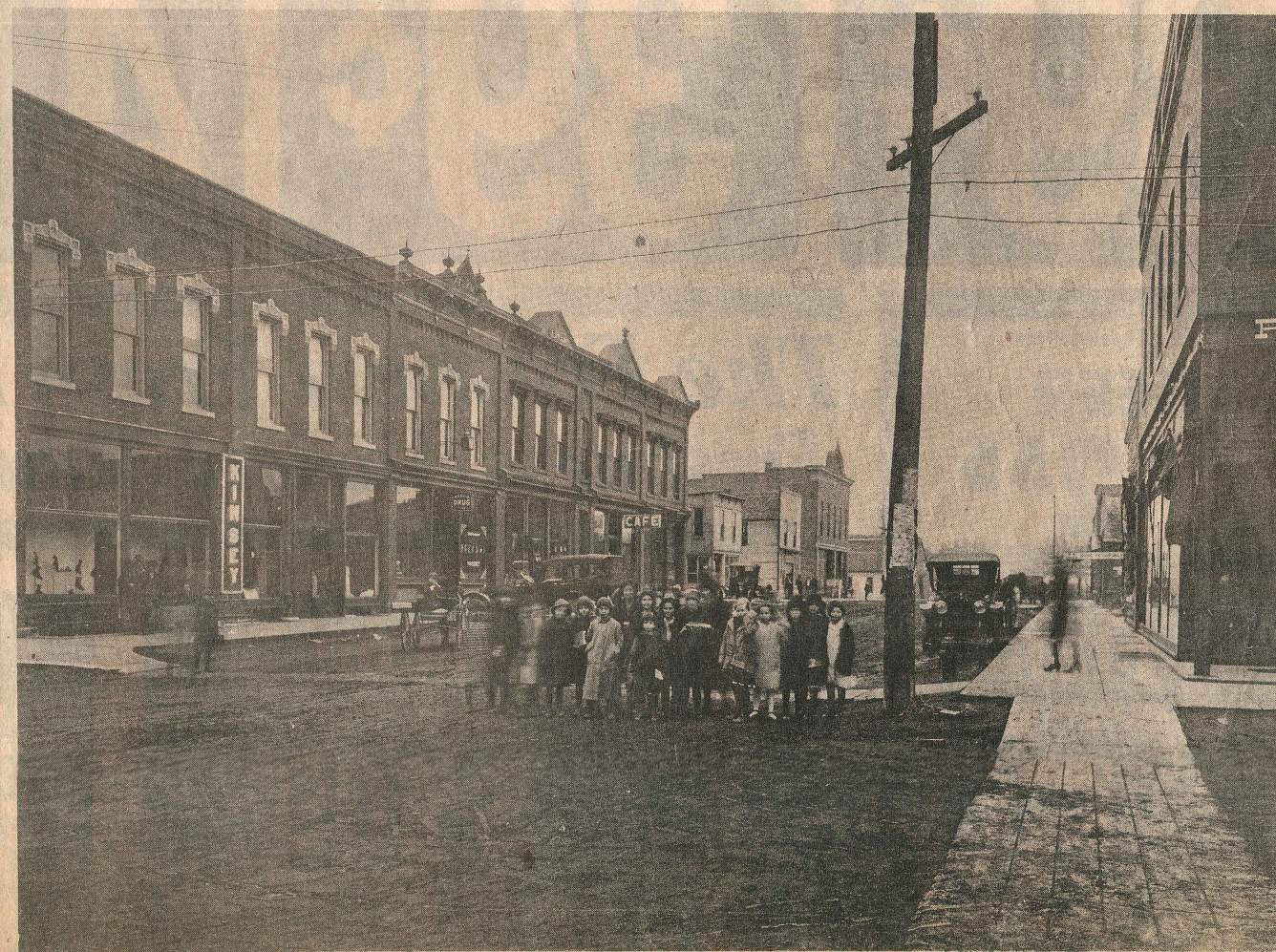
This photo was taken looking west on 2nd Street from Water, back in 1918. Notice the dirt roads and the old Model-T cars. Today, the buildings on the left side of the picture are occupied by Perrier's, Joe's Pharmacy, Lawrence Hardware and Appliance, Wagaman's Insurance, The Floral Cart and the Sportsman's Inn.