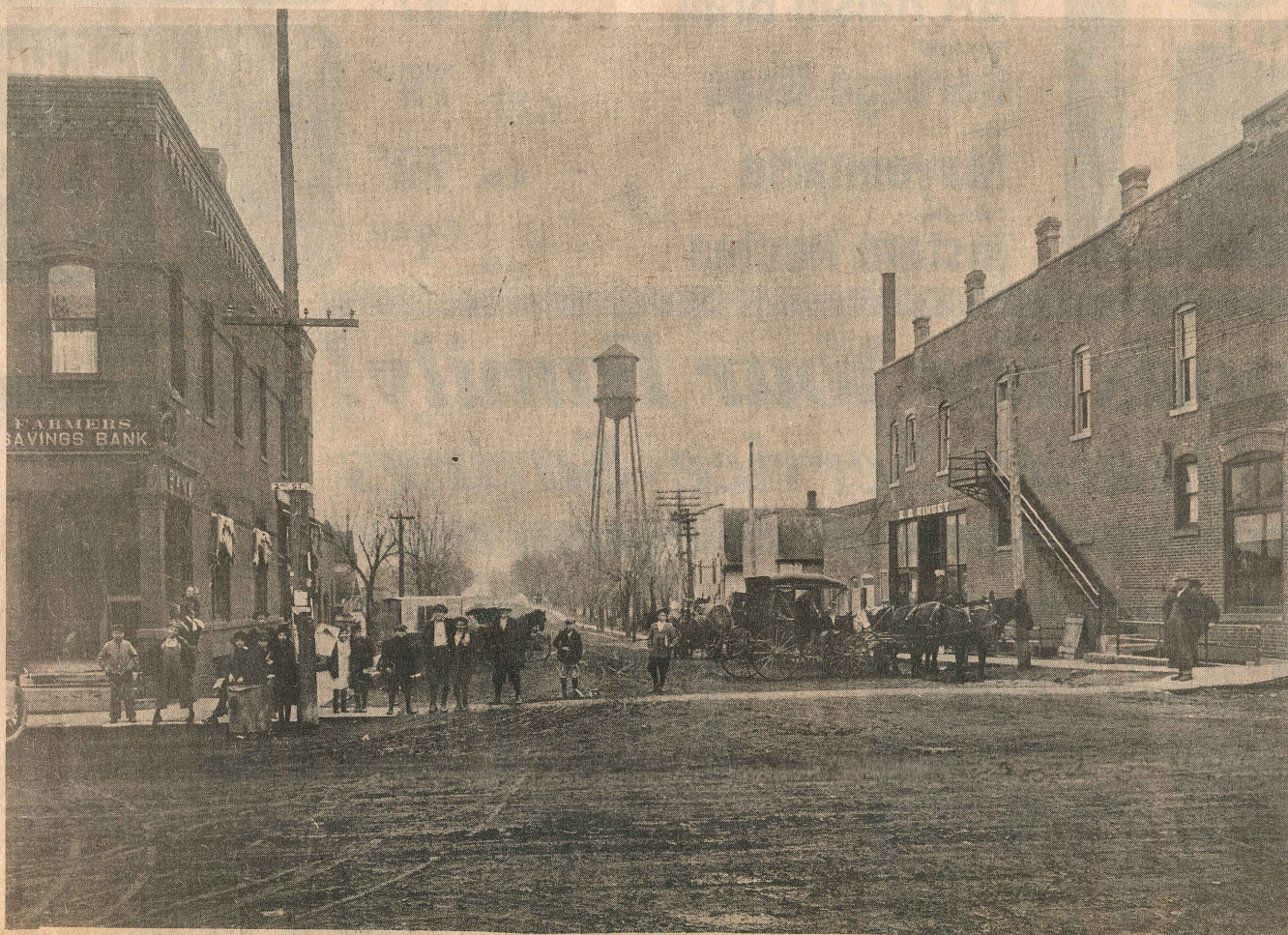
Looking south on Water Street from the second street corner back in 1910 one would have seen something like this. The Farmers Savings Bank is located where Al Sorensen is today and note the hitching posts in front of Charlie Kinsey's Store. Horse drawn carriages were still in demand, but a few daring souls had automobiles for transportation.